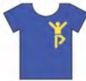
BEJ Bourne End Juniors