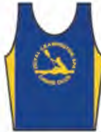
RLS Royal Leamington Spa