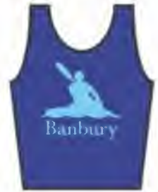
BAN Banbury & District