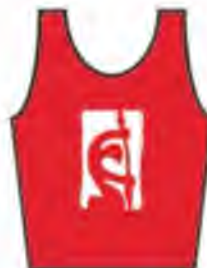
OSC Ocean Sports Club