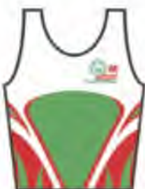
SOW Special Olympics Wales