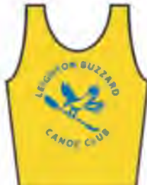
LBZ Leighton Buzzard