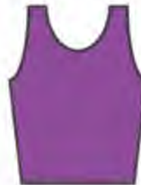
ERN Erne Paddlers