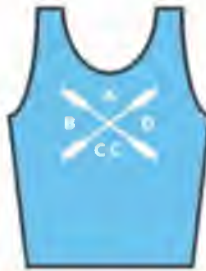
BAD Barking & Dagenham