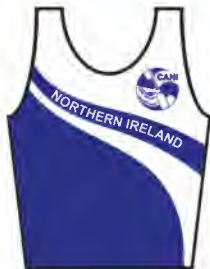
CNI Canoe N. Ireland