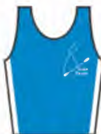
STO Stoke Racers