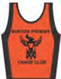
BPR Burton Phoenix