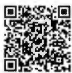
UEA Sport Scholarship Scheme

For more information on our sport scholarship scheme, course available at UEA and Norwich Canoe Club please scan the QR codes below or if you have any queries email performance.sport@uea.ac.uk .