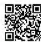
Norwich Canoe Club