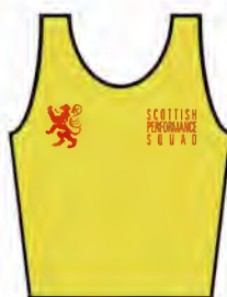
SPS Scottish Performance Squad