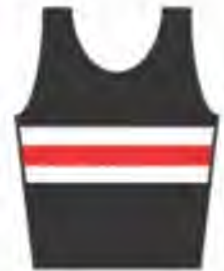
BOA Bradford on Avon