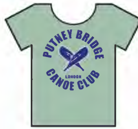
PUT Putney Bridge