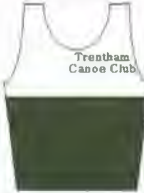
Trentham Canoe Club