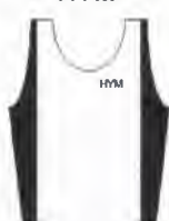
Herts Young Mariners