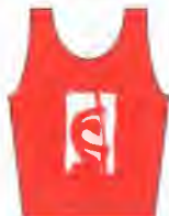
Ocean Sports Club