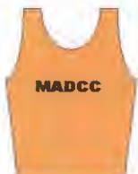
Macclesfield and District