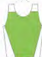
Irish Canoe Union