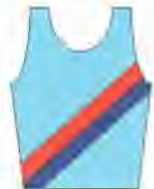
Royal Air Force