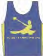
Royal Leamington Spa