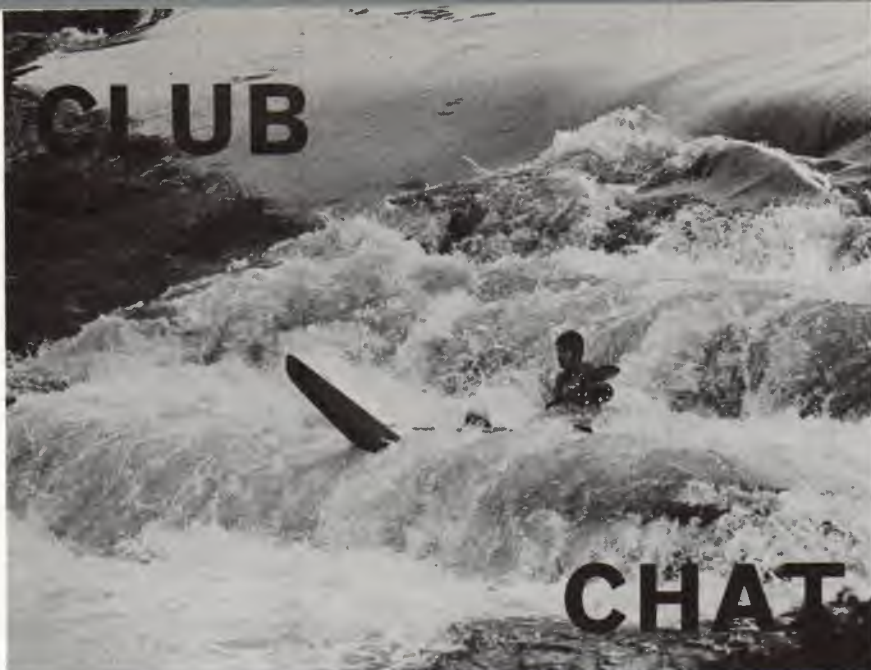
The end of a K2 as its crew attempt to negotiate the salmon steps at Cowley Bridge Weir, one of the formidable obstacles in the 1974 Exe Descent.