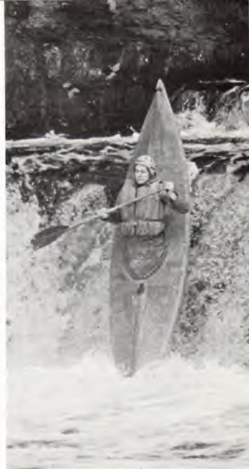
Richmond Falls, a spectacular vertical drop of 10 feet, proved a great crowd-puller at the Army, Inter-service and Open Wild Water Championship on the Swale in November. 80 canoeists were awarded a "Certificate of Insanity" for shooting the fall, into a pool well supplied with Army frogmen.

In the event itself, the Army took top honours with 91 points against the RAF's 80. (Full report next issue).