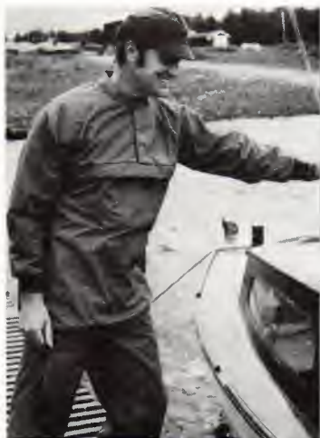
Anorak/Trouser Dunloprufe Nylon