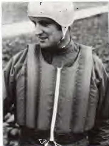
Kayak Buoyancy Vest