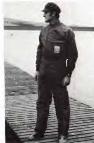
One Piece Suit Dunloprufe Nylon