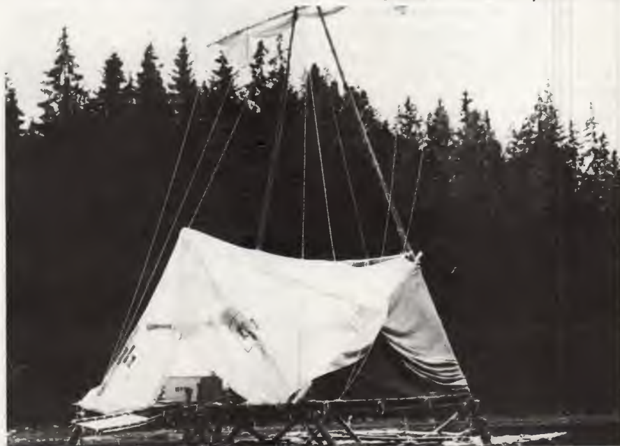
Shades on Kontiki in a peaceful inlet