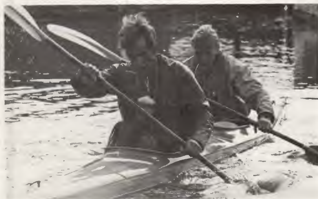
Canoeing Magazine January 1975

The race is open to Senior or Junior K2 crews only (any type of double kayak), with the Junior Class restricted to the first 100 applications. The entry fee is £6.00 per crew and closes on Friday March 7th 1975. Race details, application forms, and Rule Books (60p), are obtainable from: D. W. Keane, 12 Swakeleys Drive, Ickenham, Uxbridge UB10 8QB