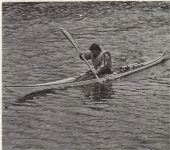
The Anas Acuta from Valley.