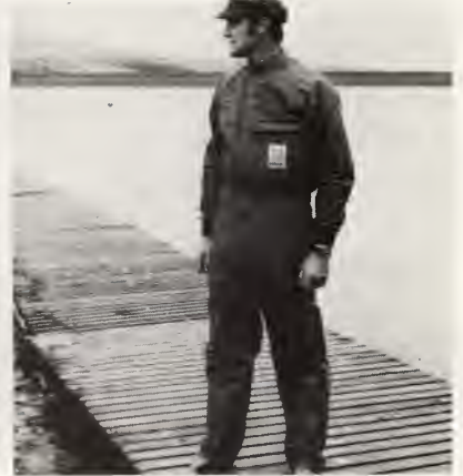
One Piece Suit

A NEW RANGE of clothing for the canoeist on the water or on the bank. As selected by the Design Centre. Dunloprufe 5oz. coated nylon. All seams sewn and sealed. Neoprene cuffs and special pockets. Double seat on trousers. Extra length Anorak. Raglan sleeve for arm mobility.