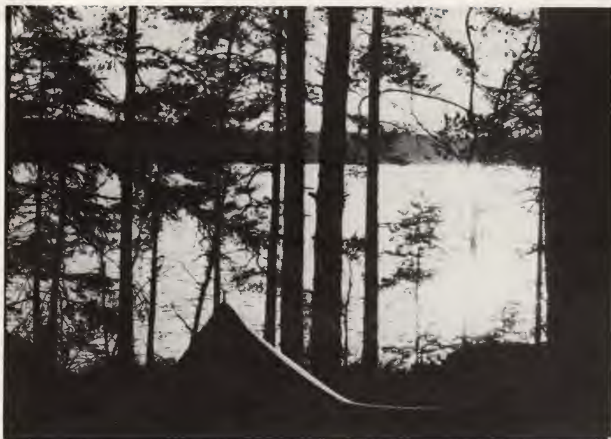
One of our idyllic camp-sites