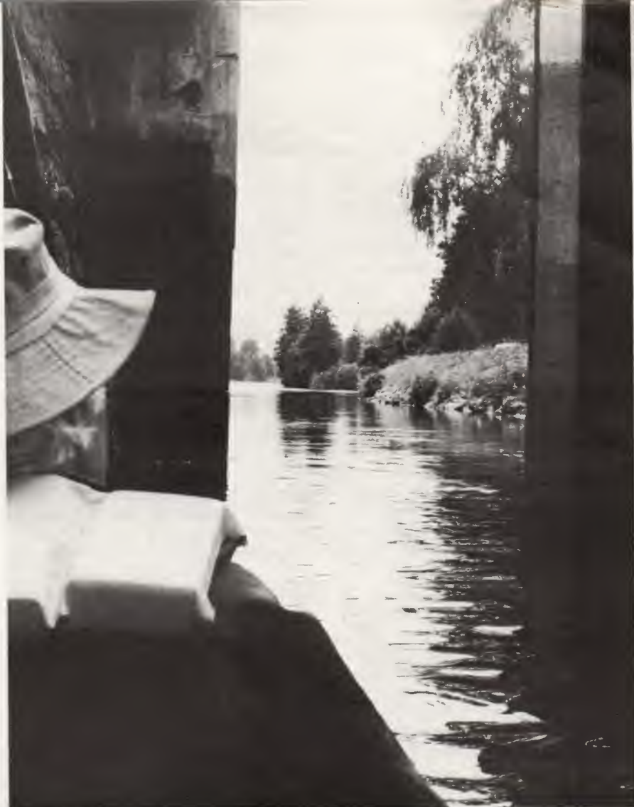
Lock gates opening — moments of keen anticipation