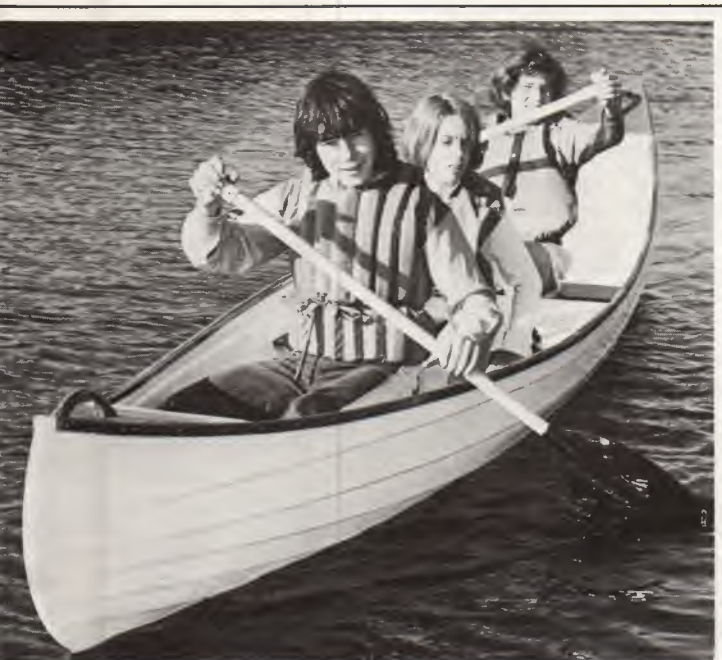
New Canadian Canoe from Avoncraft.

The firm will also be exhibiting their popular Ace Crash Helmets, and both paddles and helmets will be available for purchase via the canoe trade in the Hall.