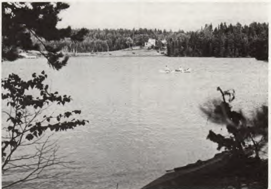
Canadians were popular.

(Literature may be obtained from the Swedish Embassy (Press and Information Dept.), 23 North Row, London W1R 2DN.)