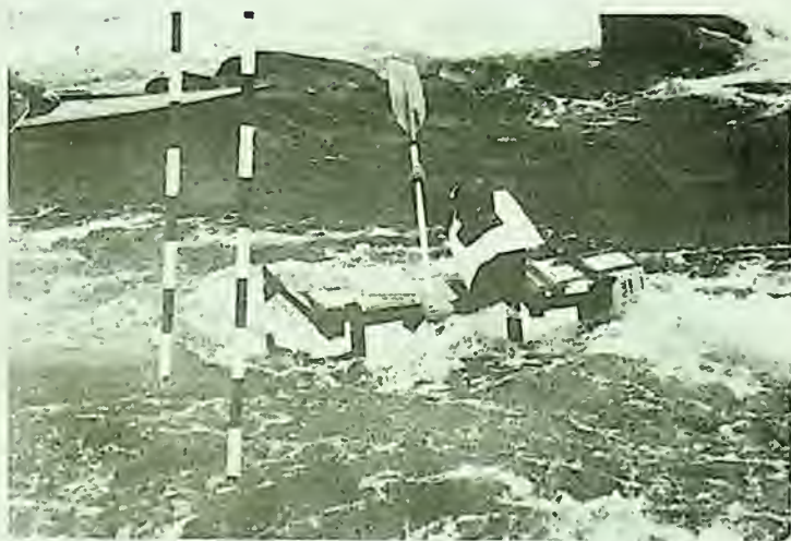
UWIST I going strong.

However, the nutty spirit of the event was more important especially to us, the organisers. Ignoring Scottish Canoe Association rules, we charged late entry fees at half the going rate, required all