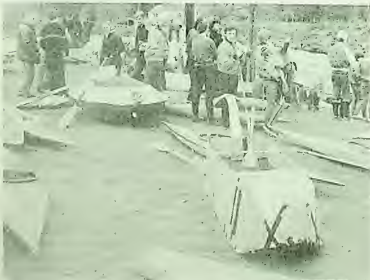
Blunt approach from Benmore I (or was it II?).

The challenge was to build a canoe entirely from cardboard (no waterproofing allowed), and to race it down 200m of Grandtully falls. The original exponent of the art, John Waters, expressed admiration for the durable and stable designs produced by the Scottish paddlers. Carpet tiles were much in evidence (or, hidden under a welter of cardboard sheets) and seams were taped, stapled or sewn. Some of the competitors put up times that would have been respectable in glass-fibre boats. They were led in the singles event by Al Denny, whose Red Cardboard Boat narrowly beat the Benmore 'A' machine.