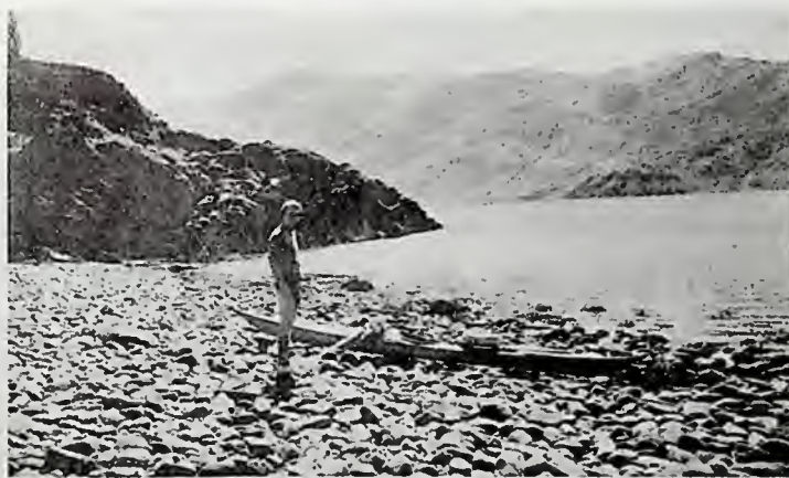
Does anybody go sea canoeing these days?

This is the sort of thing I feel we need to push canoeing forward and it is to be hoped that BBC and ITV will give our sport some more coverage.