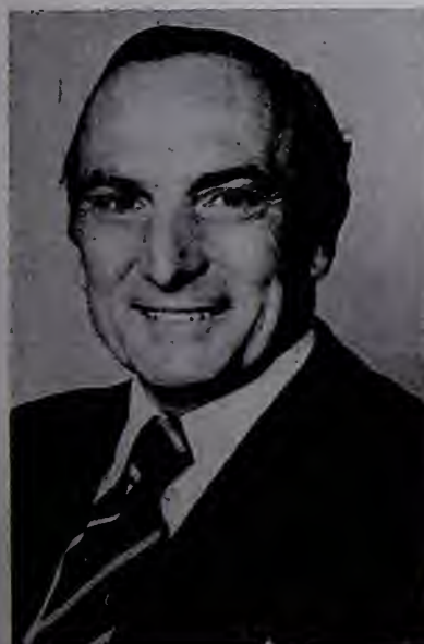
LEFT :- Performing the opening ceremony of the Exhibition is one of Scotland's most respected elder sportsmen and administrators, Mr Peter Heatly. Chairman of the Scottish Sports Council since November 1975 and Vice-Chairman of the Executive Council for four years before that, Mr Heatly is a Former Olympic Diver. As a Diver, he won gold medals at the Olympic Games in 1950, 1954 and 1958, and was team manager of the Scottish Team at the 1974 Commonwealth Games in Christchurch, New Zealand. This will be Mr Heatly's second opening ceremony for the sport of canoeing within twelve months, for he officially opened the Commonwealth Canoe Championship events in Aberlady last summer. A successful businessman, he runs his own civil engineering firm in Edinburgh.