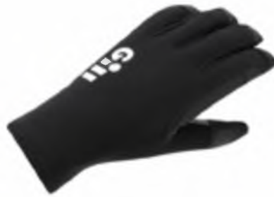
3 Seasons Gloves – £37