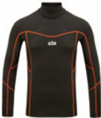
Hydrophobe Top – £55