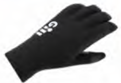
3 Seasons Gloves – £37

From water and windproof outer layers to warm and thermal mid-layers and accessories, we've got you covered this Autumn/Winter season.