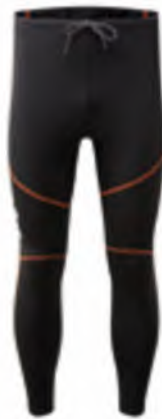
Hydrophobe Trouser – £55