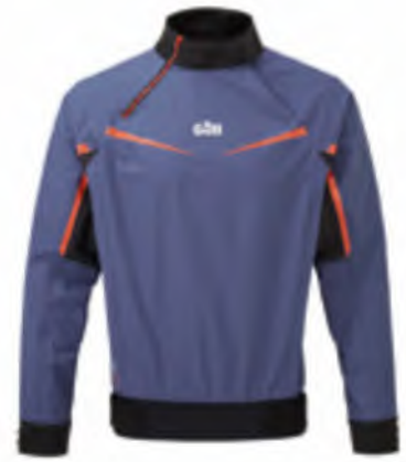
Thermoshield Top – £110