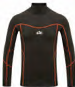
Hydrophobe Top – £55