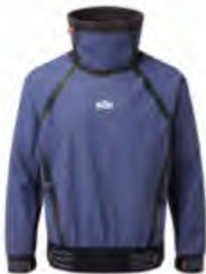
Thermoshield Top – £110