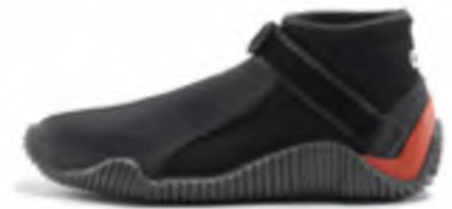
Aquatech Shoe – £42