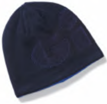
Reversible Knit Beanie – £24