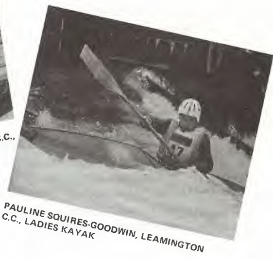
C.C., LADIES KAYAK